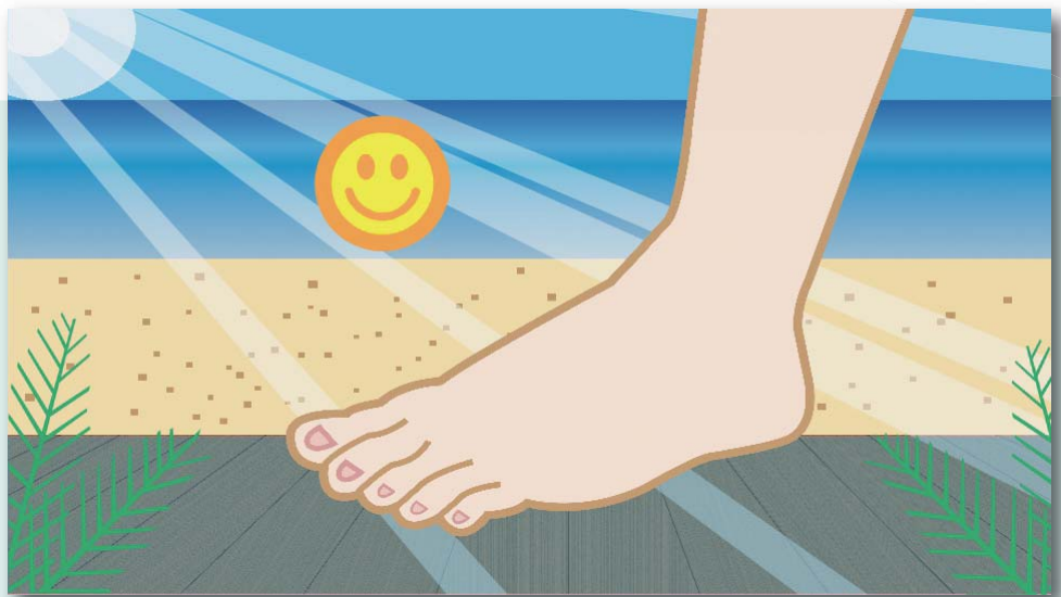
Cool Decking Series, Ambient Temperature 36 Degree Celsius, Composite Surface 52-57 Degree Celsius

The COOL DECKING™ series products has achieved a big reduction by 10-15 Degree Celsius to create a "safe" leisure environment along the beach, swimming pool, etc.